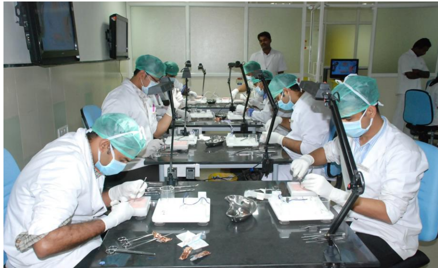
Students learning Basic surgical skills